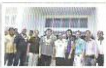
Bacoor District Hospital